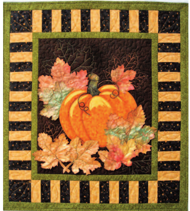
Pumpkin Wallhanging with Tyvek Leaves