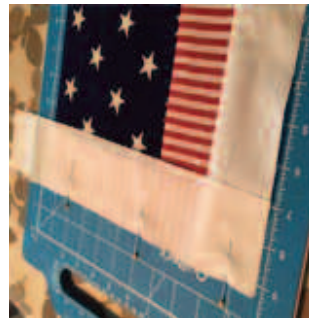
Quarter round stitching

The 2 1/2" red and white strips are cut in units of W6 1/2", W8 1/2", R8 1/2" and R10 1/2" or R6 1/2", R8 1/2", W8 1/2" and W10 1/2" . Place around square using quarter round log cabin format.