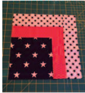
finished block - 10-1/2 inches