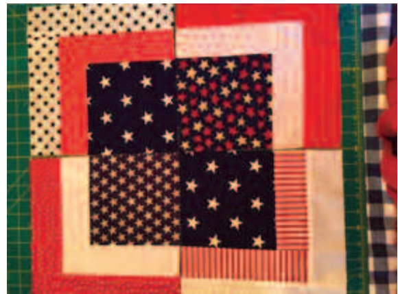
Four block array